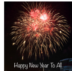
Happy New Year To All